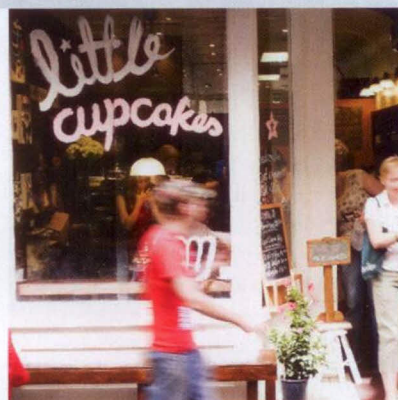
Graffiti-covered Misty (top) on Hosier Lane is the place for a drink; don't miss out on eating at MoVida (above) or MoVida Next Door; indulge your sweet tooth at Little Cupcakes on Degraeves Street (left)